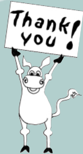
DONETA BROWN ILLUSTRATIONS